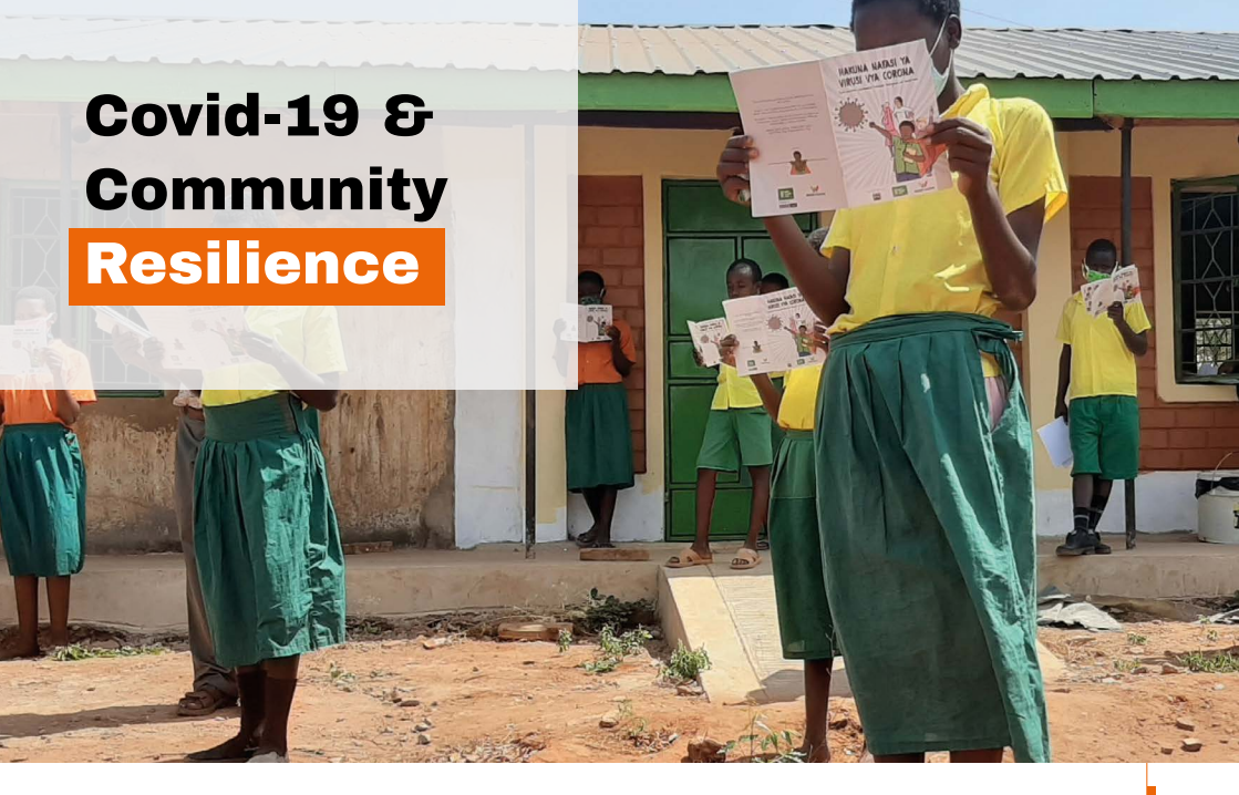
Kenya, Comic books distribution in Kitui county, Kasarani primary school.

The COVID-19 pandemic is testing the resilience of communities globally, with very differentiated impacts, exacerbating existing inequities and creating new ones. To help shape an evidencebased response to COVID-19, Alliance 2015 members jointly conducted a survey in 25 countries, covering over 16,000 women, men and trans/non-binary people over a two-month period (from mid-October to mid-December 2020). The large sample size and distribution of respondents, living in urban, rural and